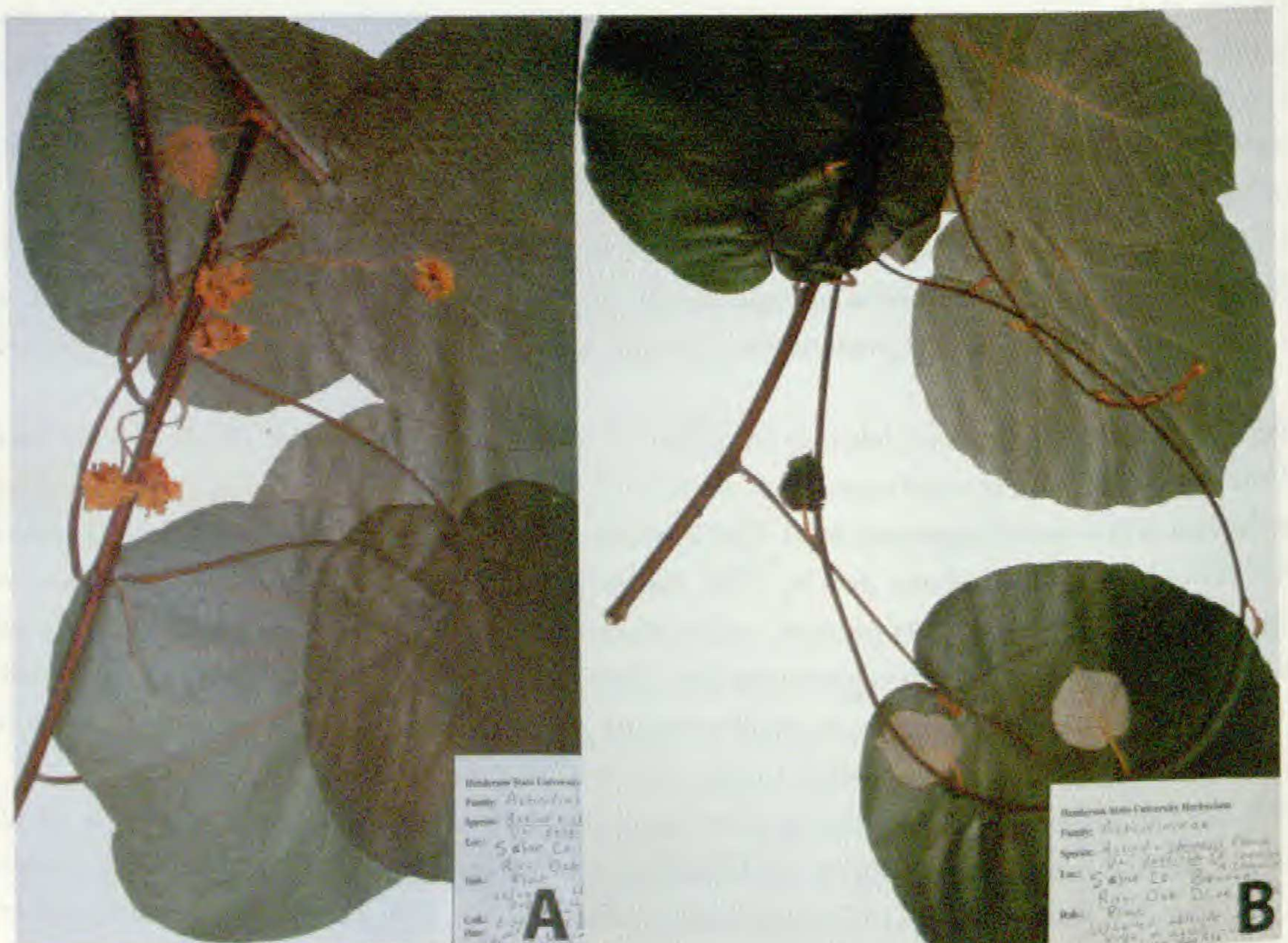
FIG. 2. Herbarium specimens of A. chinensis var. deliciosa (specimens are from Saline County, Arkansas). A. Staminate flowers and leaves. B. Leaves and twining stem.